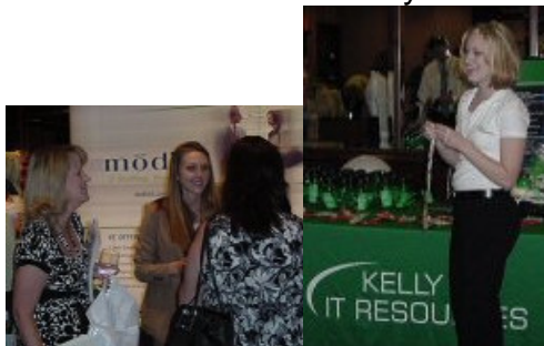
Here are just a few photos of the vendors that were at this years Safari.