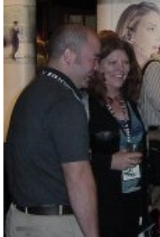
A few SacHDI members having some memorable experiences. They are visiting the vendors and enjoying their session.