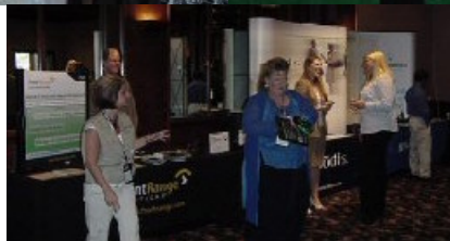
We really look forward to SacHDI's annual event for 2009. All of us on the SacHDI Board would like to thank everyone that attended the vendors and volunteers that made this year Safari 08 a huge success!!